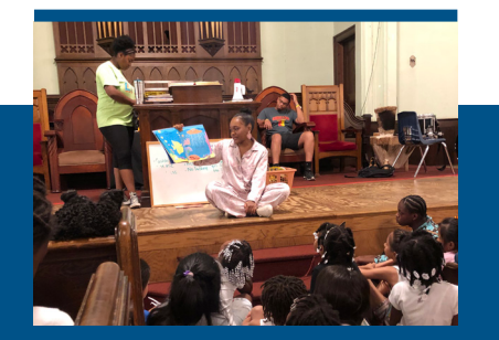
Enrollment slots were doubled in 2019